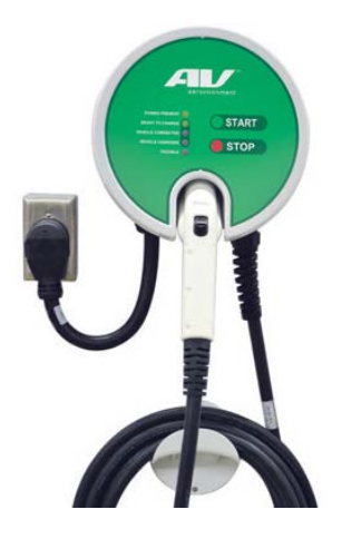
Figure 3. Example of Level 2 Charging