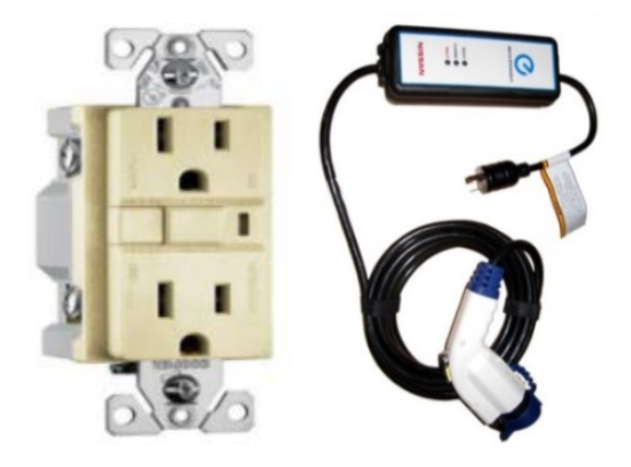
Figure 2. Examples of Level 1 Charging