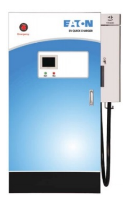
Figure 4. Example of DC Fast Charging