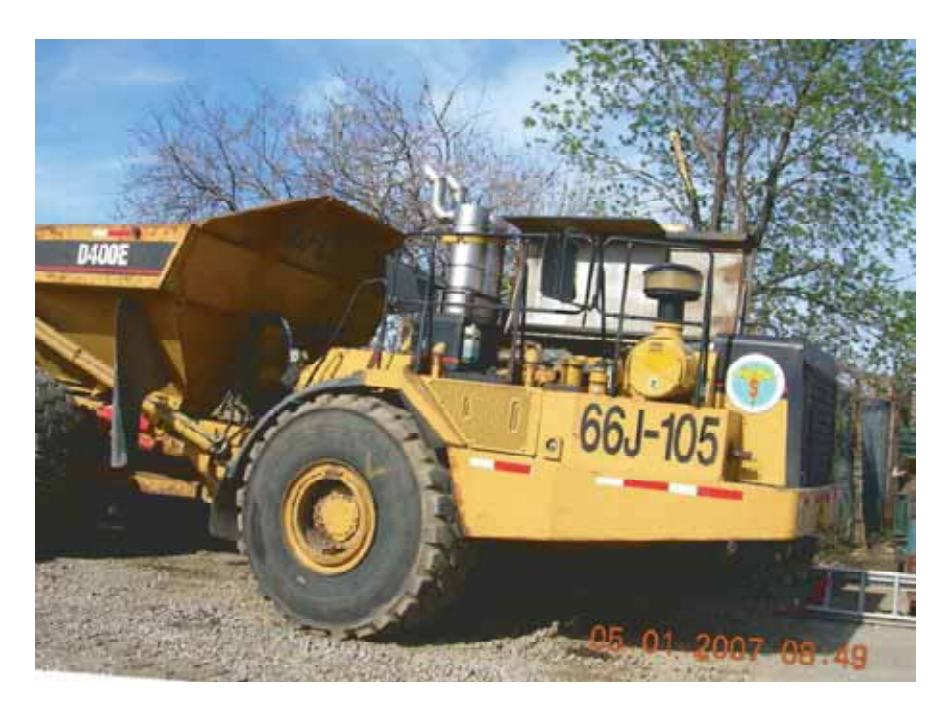
Figure 3-7. Johnson-Matthey DPF installed on a CAT D400 Dump Truck