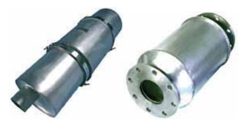
Figure 3-3. CleanAIR Systems PERMIT PDPF