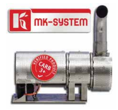
Figure 3-2. Huss ADPF

The Huss MK system is integrated in the exhaust piping of the vehicle, usually in place of the original muffler. The filter medium is made of silicon carbide. The filter can be used for approximately eight working hours, at which time the maximum allowed backpressure is reached and the filter must be regenerated. During regeneration, the diesel burner is ignited while the engine is shut-down. Depending on the filter size, regeneration takes from five to 35 minutes. Approximately three to 10 ounces of diesel fuel are necessary for each regeneration period. The entire process is supervised by the HUSS electronic control device.