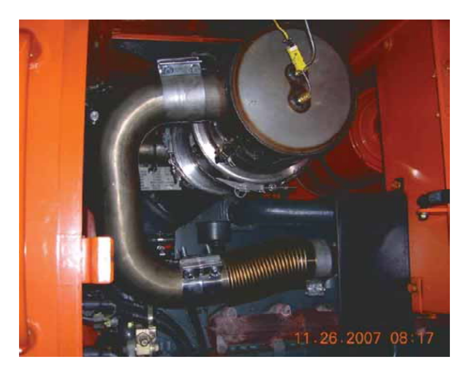
Figure 3-12. Left-Side View of the ECS DPF Installed on a Case 821 Rubber Tire Loader