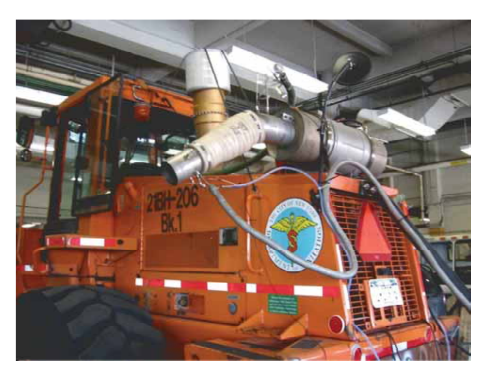
Figure 3-11. CleanAIR Systems PDPF Installed on a Case 821 Rubber Tire Loader and Instrumented for In-Use Emissions Testing