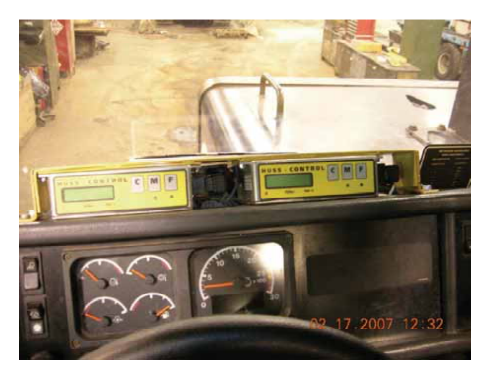
Figure 3-10. In-Cab Display of Huss ADPF Control Modules Installed in the CAT D400 Dump Truck