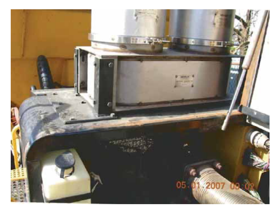
Figure 3-8. Front View of the Johnson Matthey DPF Mounting Arrangement