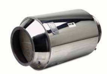
Figure 3-5. ECS Purifilter

Purifilter displays regeneration balance points between 280 °C and 325 °C, varying with both vehicle engine and application. Continuous passive filter regeneration occurs during a vehicle duty cycle when the exhaust temperatures are above 280 °C for more than 25% of the time. The catalyst also serves to oxidize more than 90 percent of carbon monoxide and hydrocarbons. Purifilter models are available in five different particulate filter muffler types. The modular design allows for 360° rotation of the muffler inlet and outlet sections to provide a range of fit. A backpressure monitor kit is provided with each Purifilter. The Purifilter has been certified under the Swedish Environmental Zones -- Off-Road Engines Program. Results obtained from a Perkins 1004 engine over the ISO 8178 Cycle show that PM was reduced by 91%, HC by 96%, and CO by 99%. Off-Road vehicles suited to the Purifilter include construction vehicles, mining vehicles, and other heavy industrial machines.