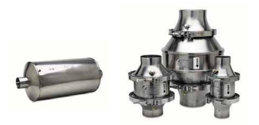
Figure 3-4. ECS Diesel Oxidation Catalyst Products

The Purifilter diesel particulate filter employs a base and precious metal catalyst impregnated onto a silicon carbide surface to passively oxidize accumulated particulate while complying with CARB NO_2 limits. The silicon carbide filter substrate is formed in a honeycomb design; alternating cells are open on one end and plugged at the outlet end. As the exhaust flow enters the open inlet cells, it is forced to pass through the micro-porous walls to the outlet cells, filtering the diesel particulate from the exhaust. The filter substrate is coated with a proprietary catalytic layer to reduce soot combustion temperatures to a level within the normal exhaust temperature range of diesel engines.