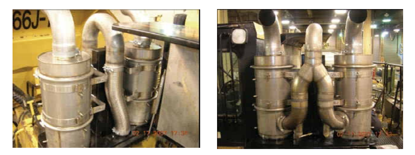
Figure 3-9. Front (left) and Rear (right) View of the Huss ADPF Dual Filter Retrofit Installed on a CAT D400 Dump Truck