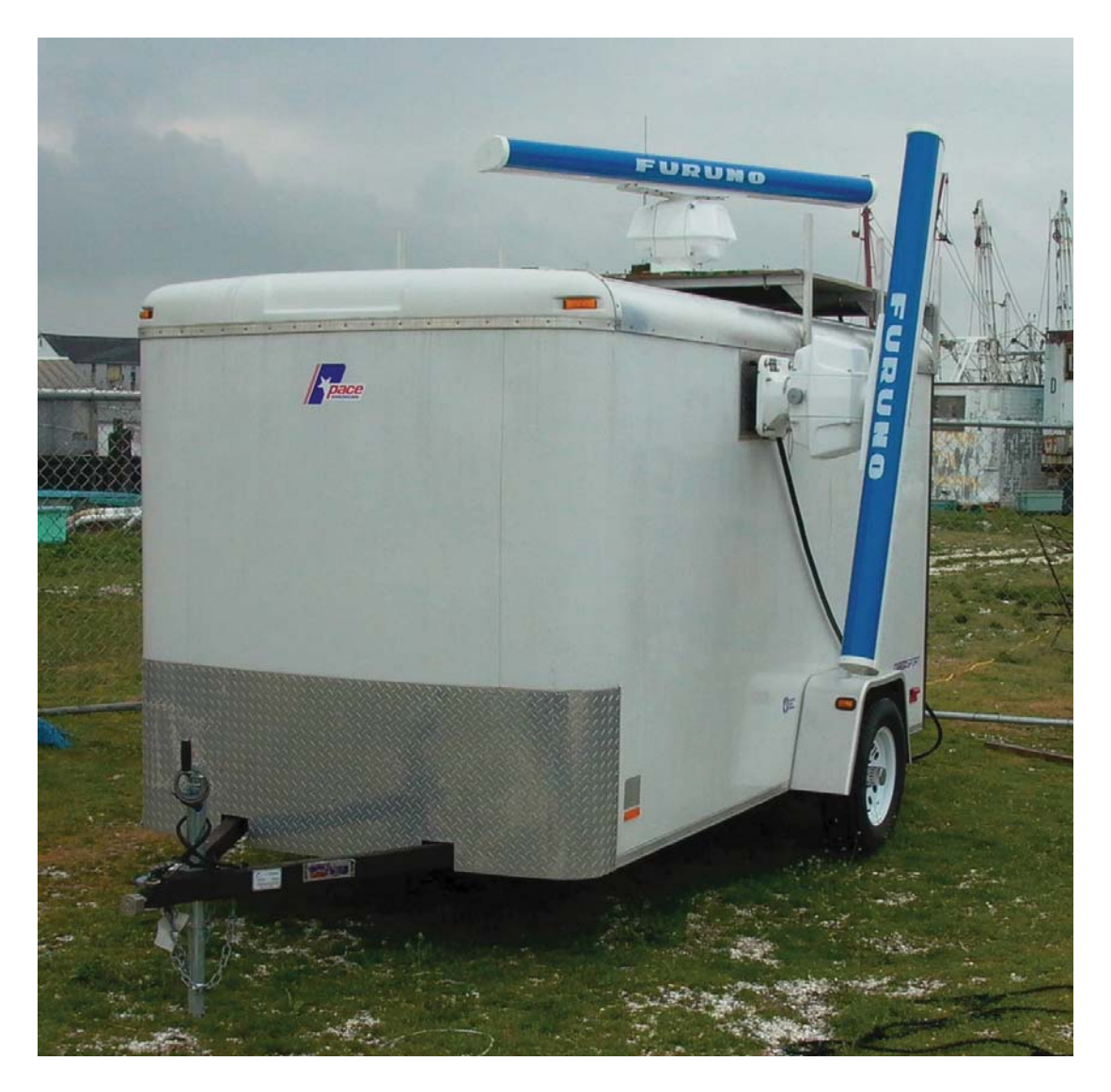
Figure 1. Dual radar system with horizontally and vertically oriented antennas that operate simultaneously. The system allows for data collection on passage magnitude (vertically-oriented radar), altitude (vertically-oriented radar) and flight direction (horizontally-oriented radar).