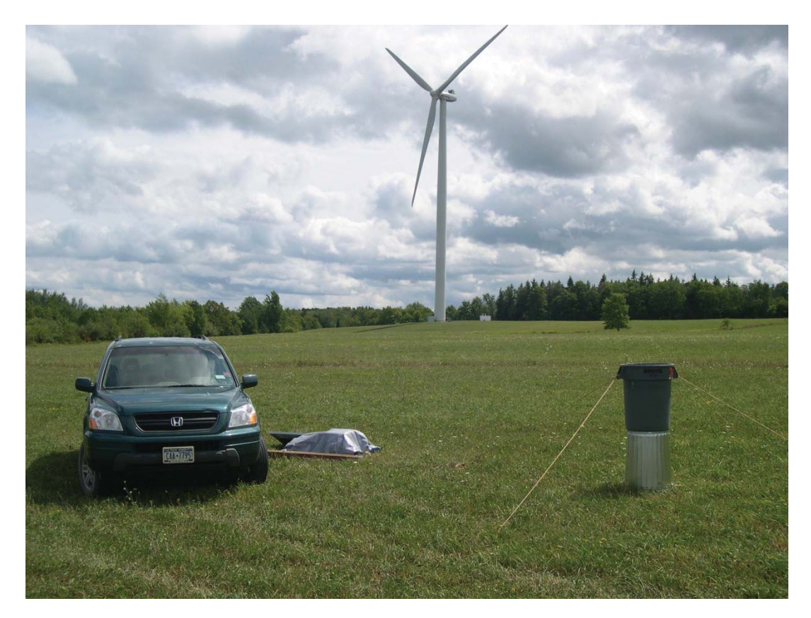
Figure 3. Avian acoustic recording station. Skyward-facing microphone is in gray cylinder. Recording gear and batteries are under plastic tarp.