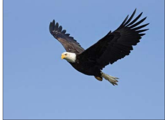
Fish-eating mammals and birds, such as this river otter (left) and bald eagle (right) are sensitive to mercury bioaccumulation because of their positions at the top of the food chain.

There are a number of opportunities for future comparisons of wildlife risk that were identified during this study. In particular, it is important to attempt to rank recovery potential of affected populations and habitats. Wildlife species and groups of species have different abilities to handle risks. Some populations have the reproductive potential to offset losses more readily than others. Some habitats can quickly recover once a particular stressor is removed, whereas other habitats may have changed so much that recovery is not possible.