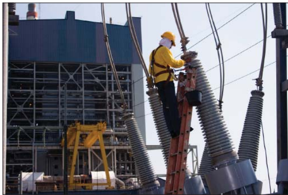
Worker at power station switchyard.

wildlife individuals, without evidence of, or reason to expect, an adverse effect at the population level. This does not mean that wildlife effects to individuals are not important. Nevertheless, if an individual effect does not result in a measurable impact on the population, then it is not considered ecologically significant. It is important to note, however, that effects to individual animals can be ecologically significant in at least two situations. First, endangered and threatened species often cannot afford to lose even small numbers of individuals without further imperiling the population or even the species. Second, demonstrated effects on individuals can become ecologically significant when they are shown to indicate a population-level effect.