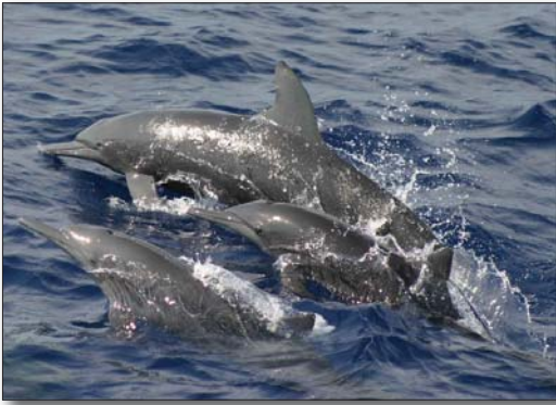
Marine mammals, such as dolphins and whales, can be adversely affected by offshore oil drilling. Not only is there a risk for oil spills, but it has been suggested that sonar used for oil exploration may cause marine mammal beach strandings.

and power generation than other life cycle stages of electricity generation.