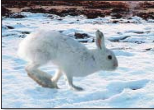
Global warming can contribute to a multitude of ecological effects, including shifts in seasonal patterns of migration, food availability, and increased vulnerability of some species due to climate-related adaptive strategies.

Before the electricity generation source can turn the turbine, it must be extracted or harnessed. Coal, oil, natural gas, and nuclear materials are extracted from the ground and then transported to the power station, sometimes hundreds or thousands of miles away. Electricity generation by hydro requires a ready source of flowing water (river or reservoir), whereas electricity generation from wind energy requires a steady and reliable wind flow pattern.