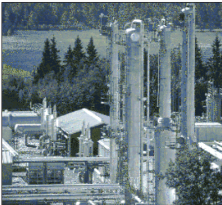
A gas power plant.

stacks, and cooling towers during power generation. Wildlife species exhibit varying risk, depending on location and dimensions of the collision objects relative to species ranges, flight patterns, and migratory behavior.