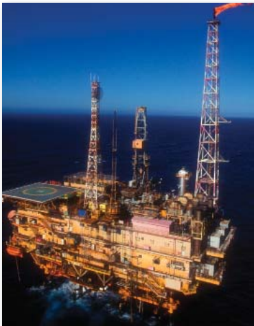
Offshore oil rig drilling platform in the ocean.

All electricity generation sources affect wildlife to some degree, although the mechanism and severity of impacts differ. There are many ways to classify the impacts of electricity generation on wildlife. Effects can be direct and/or indirect; acute or chronic; individual or cumulative; and local, regional, or global. Each type of effect was explored in this study.