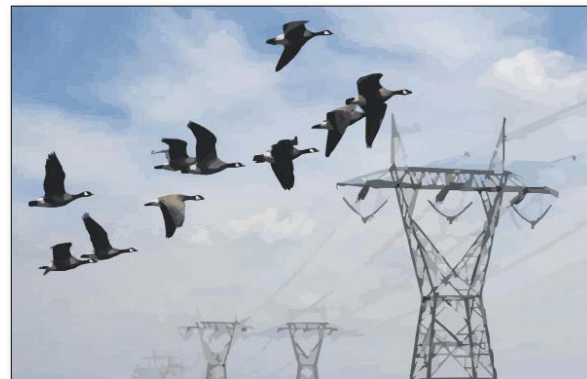
Graphic rendition of one risk of power transmission: wildlife contact with power lines. Power lines pose risk of collision and electrocution to birds and bats.