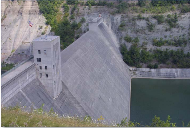
A hydroelectric facility located on the Genesee River in New York.