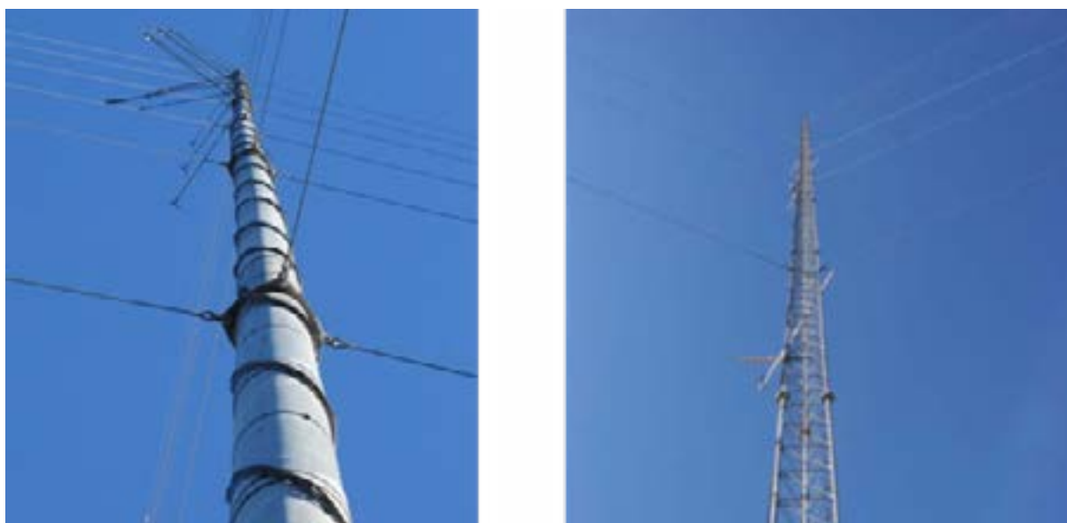
Figure 3-1. Examples of guyed tubular meteorological mast and guyed lattice meteorological towers

Meteorological masts or towers are typically 60 or 80 meters tall and have monitoring equipment at multiple heights. These towers use anemometers, wind vanes, and temperature sensors to measure the wind speed, wind direction, and temperature. This wind resource data is collected and stored by a data logger for later analysis.