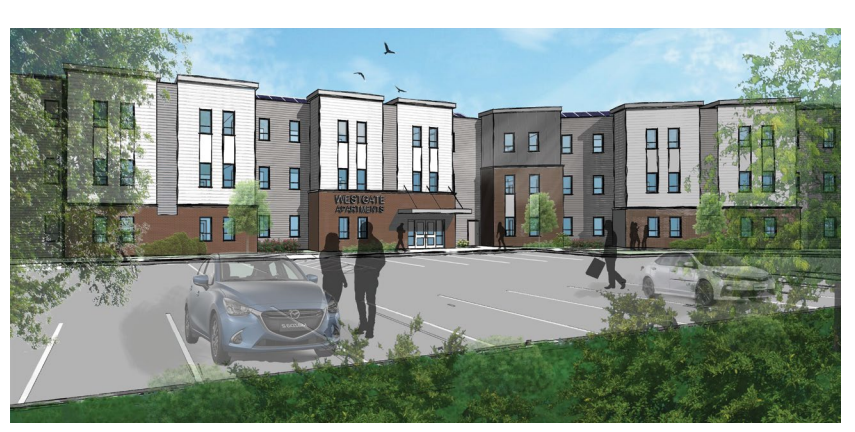
Exterior rendering by SWBR Architects

Space conditioning is provided through a highefficiency ASHP. Each unit will have its own mini split heat pump for individual access and control. Domestic hot water (DHW) will be provided through a Sanden CO<sub>2</sub> centralized ASHP. The system includes ten outdoor units serving five central storage tanks and has a coefficient of performance (COP) of 2.79, meaning it is nearly three times more efficient than an electric resistance water heating system. Continuous fresh air is delivered through an ERV system with 83% sensible heat recovery efficiency (SRE). The electrical load is partially offset by solar panels.