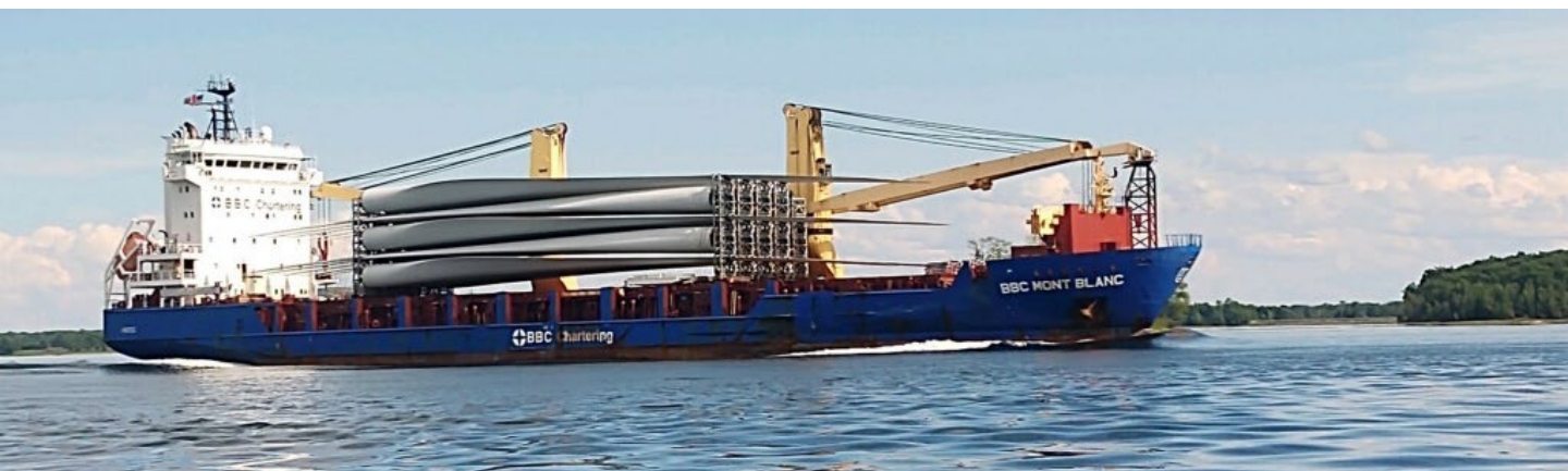
Off-shore wind turbine blades being transported.