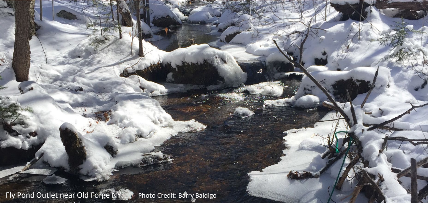
Fly Pond Outlet near Old Forge NY