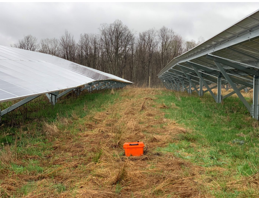
A sensor installed at the Cascadilla site under Agreement #154272.