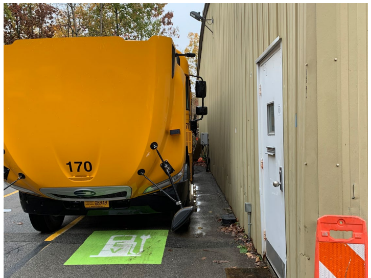
Level 2 chargers can be wall mounted to minimize footprint. An example installed in Croton-Harmon UFSD is mounted in the garage with a cut-through so buses can be charged inside and outside the maintenance garage.