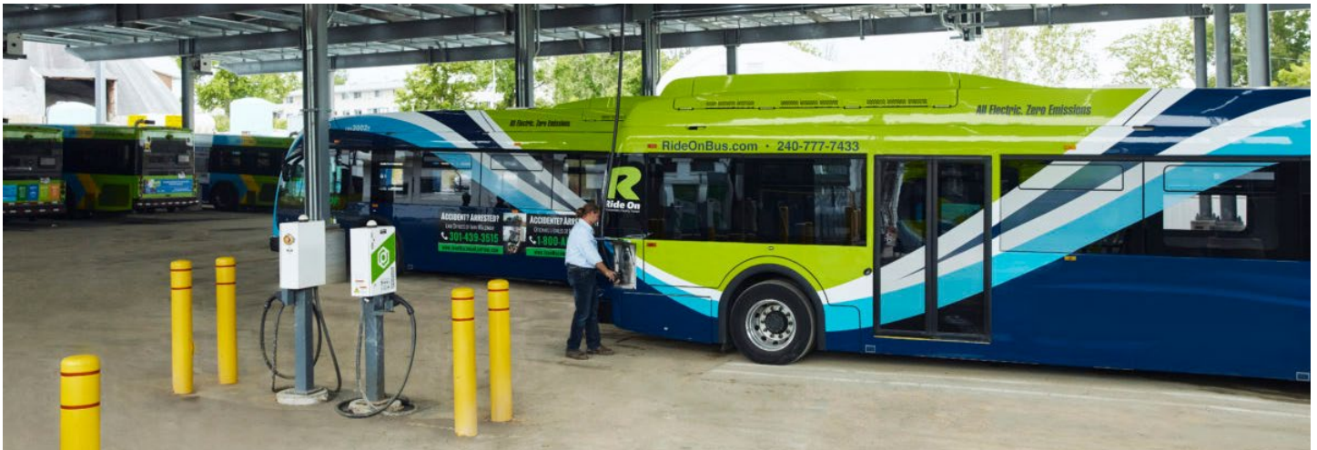
This bus depot in Maryland shows pedestal mounted and overhead dispenser chargers. Overhead dispensers can be used when a roof structure is present to minimize the chargers' footprint.