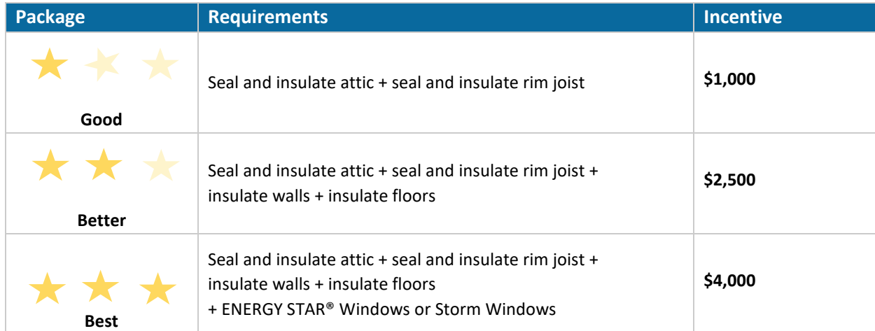
Table 3. Standard Load Reduction Package Options

Load Reduction Contractors will work with customers who have been targeted based on their housing characteristics, demographics, and interest in energy savings, improved comfort, and/or heat pump technologies to install standard packages (including air sealing, insulation, and ENERGY STAR® windows) to solve specific home heating and cooling needs.