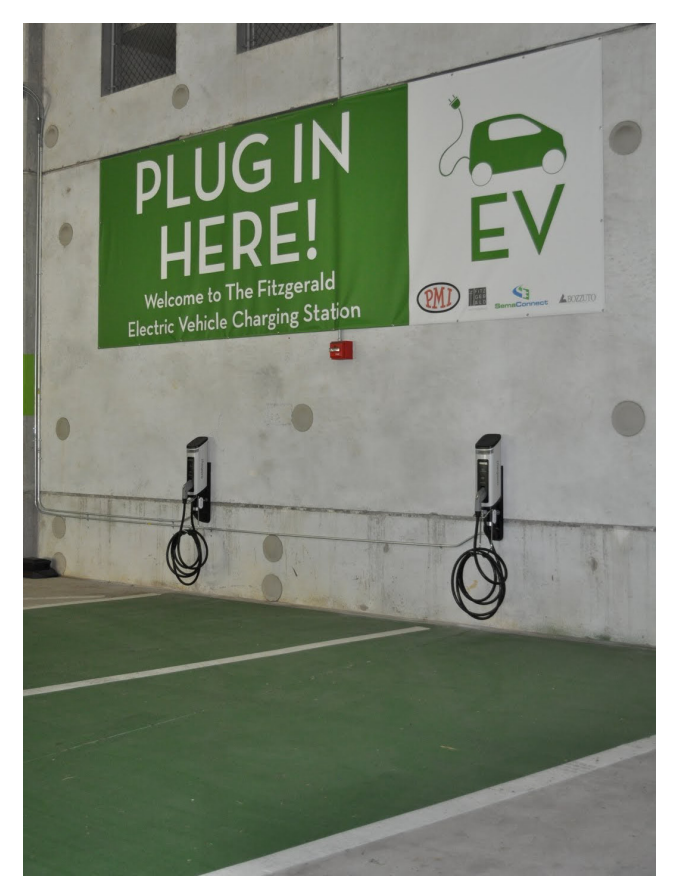
Figure 15: EVSE in the parking garage of The Fitzgerald, a 2011 multi-family development of the Bozzuto Group.

User tenure is a challenge in the multi-family cluster. For rental units, lost opportunity costs associated with designating dedicated EVSE