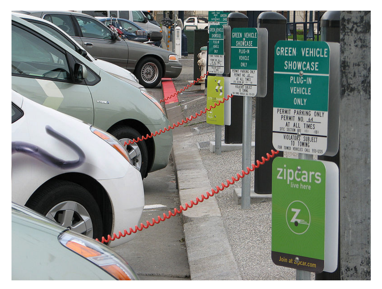
Figure 6: EVs charging outside San Francisco City Hall..

Across the TCI region, approximately 25% of all EVSE installations are publicly accessible locations in town and city centers, making the downtown cluster extremely important for overall deployment.