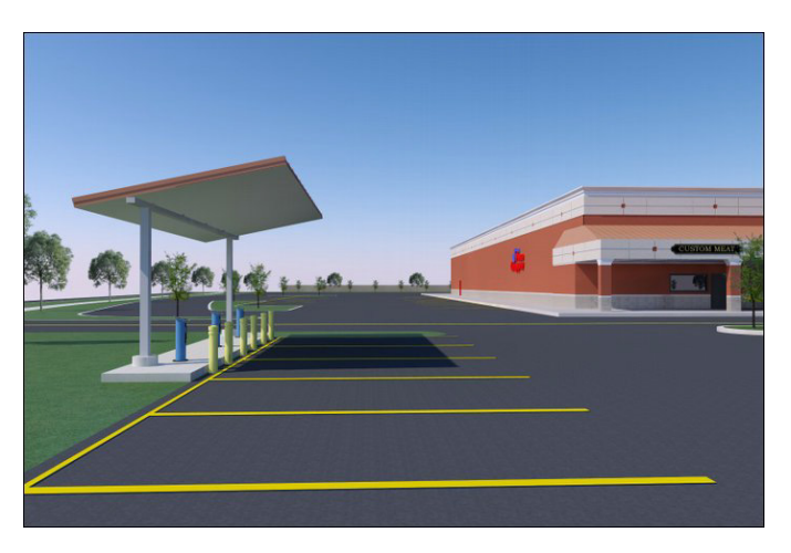
Figure 7: Rendering of EVSE installed in a Price Chopper Supermarket parking lot

Length of stay will depend on the retail category or configuration. Convenience retail, with the possible exception of large-scale supermarkets, may not present a strong