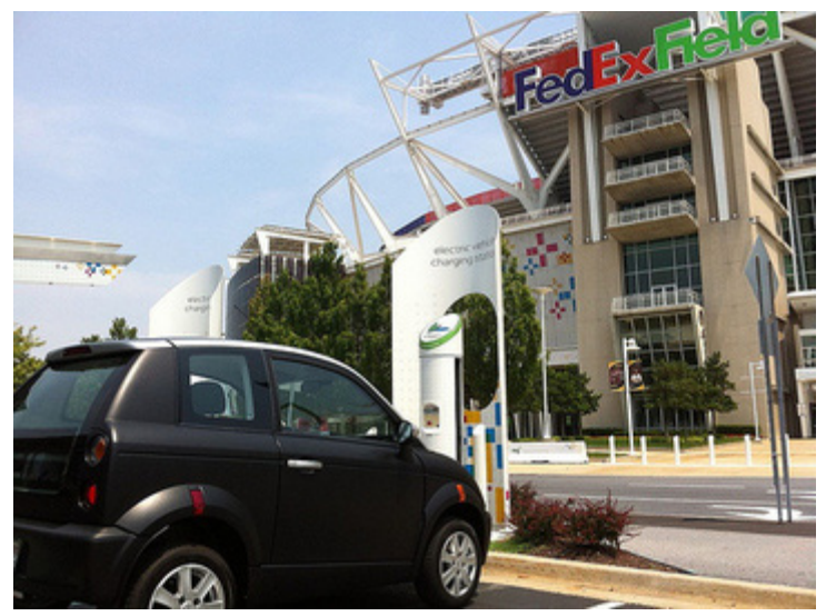
Figure 12 : EVSE at FedEx Field in Landover, Maryland.

Management issues are the most important consideration for leisure destinations. Parking facilities most appropriate for EVSE in this cluster are usually for dedicated use and employ traffic and parking attendants. However, other locations, such as state parks, may have limited parking amenities. In many