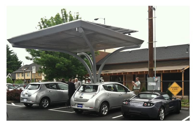
Figure 13: Solar canopy with EVSE at light rail station in Portland, Oregon (Source: Portland Development Corporation).

Parking lots at intermodal facilities are fertile venues for EVSE deployment due to regular travel behavior and relatively short distances from the home. Regional transport cluster