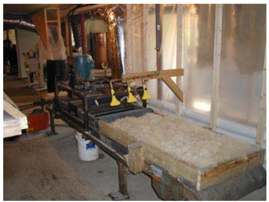
Figure 12. Clean wool about to run under the water jets and into the felting machines, where it is vibrated and rubbed together, causing the separate fibers to cling together in a felted mat.