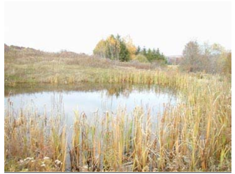
Figure 1. Pond built to collect rainwater for scouring process.