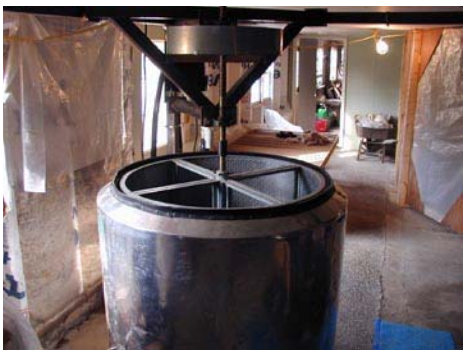
Figure 5. Customized scouring vessel made from an old pasteurizer. Separate sections can segregate wool of different growers, and still allow a single washing to conserve energy and water.