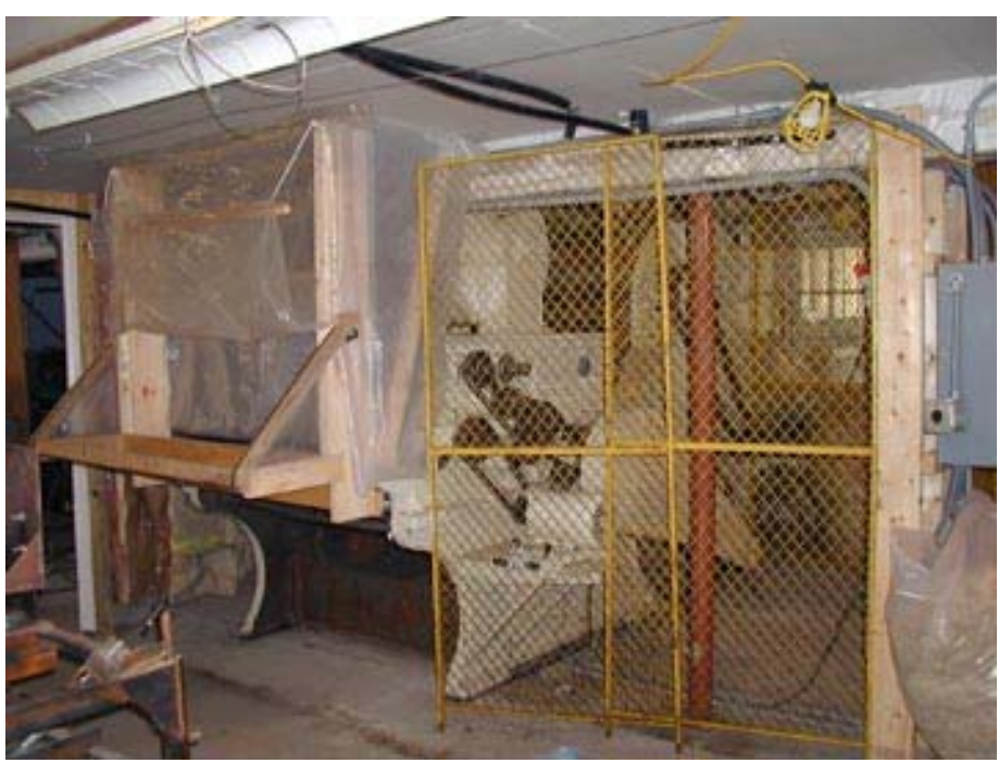
Figure 3.. Side view of picker exit, where wool is collected after it has been "picked" clean of any vegetable matter that remained after washing.