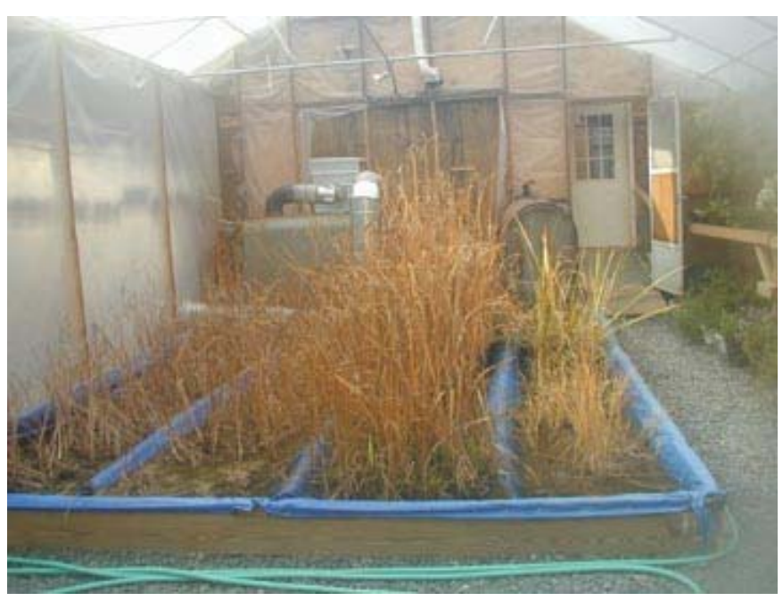
Figure 10. The greenhouse adjacent to the barn, where plants are grown with water from the scouring process. The nursery plants benefits from the "organic waste" eliminated from wool. The center area grows wetland plants (mostly cattails) whose roots are used to "polish" water to its original level of cleanliness, at which point it is recycled to the pond for use in additional scouring.