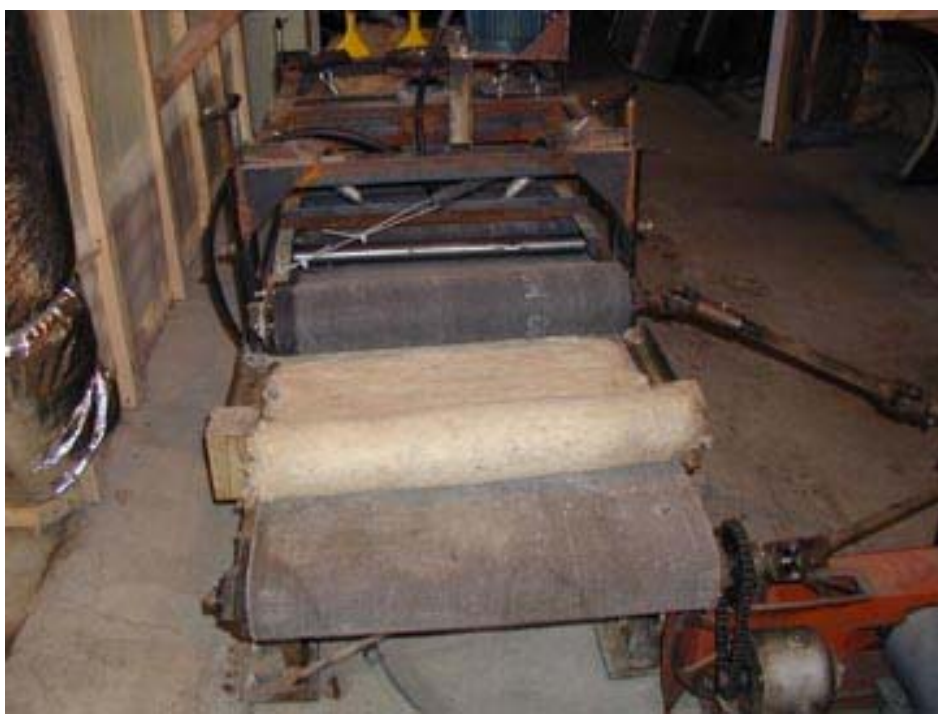
Figure 13. A roll of felted weed barrier at the finished end of the felting machine.