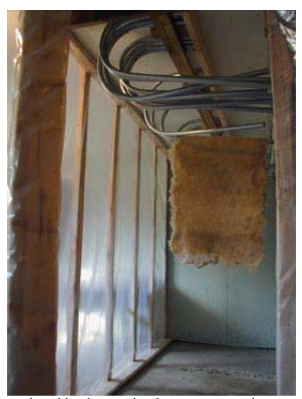
Figure 6. The drying room where felt is hung to dry if it retains too much water after being felted.