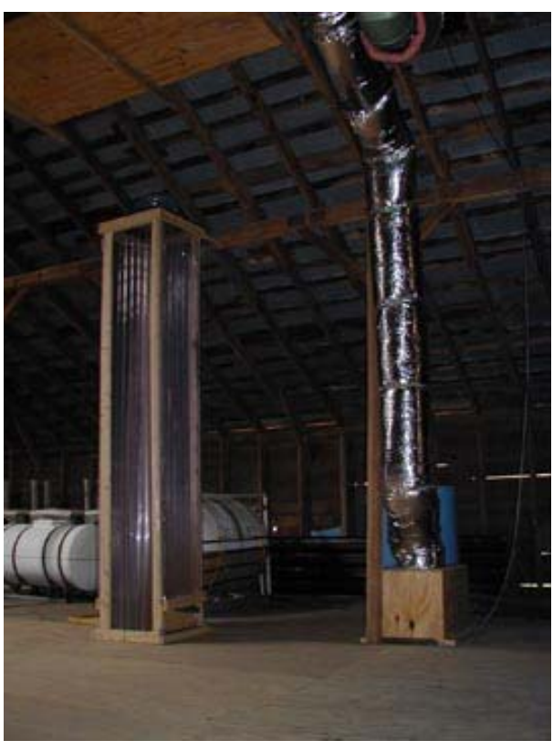
Figure 7. The drying tower on the left, where washed wool is blown dry. On the right is the air duct used to bring excess heat from the upstairs loft down to the production area.