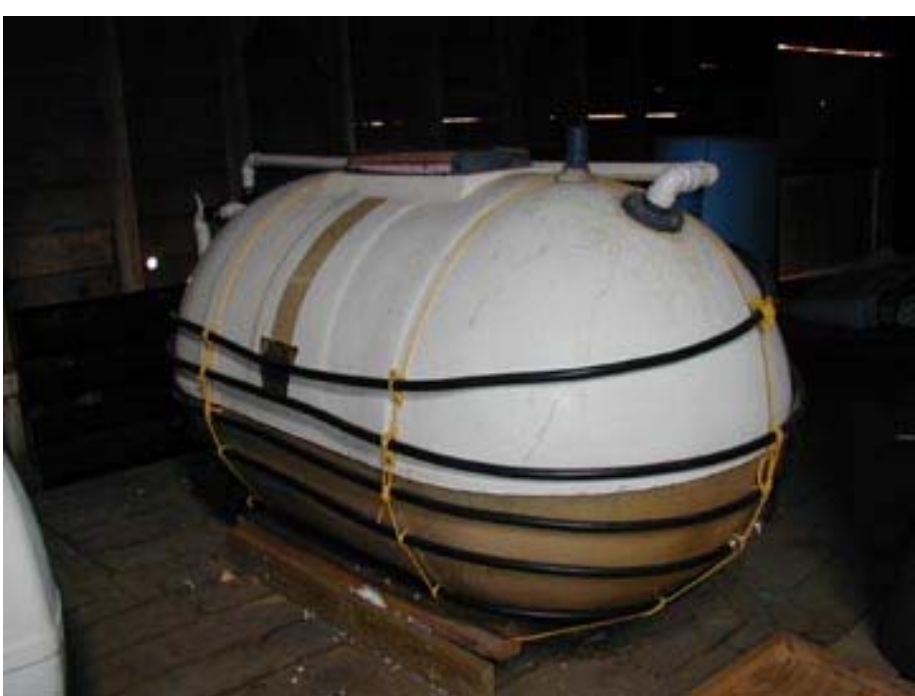
Figure 8. The digester built to take organic waste from the wool and create methane.