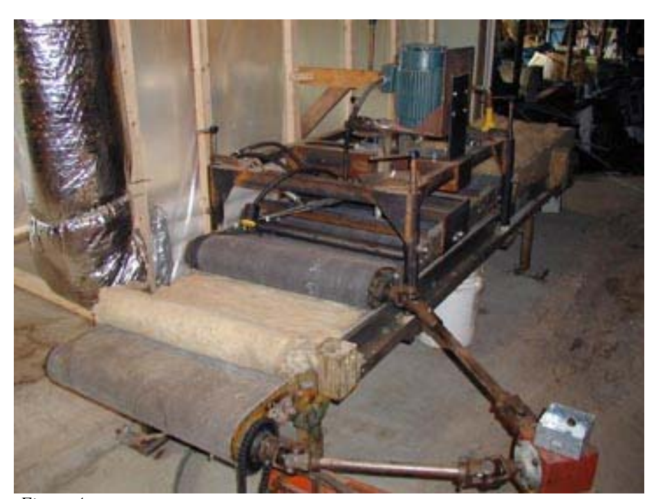
Figure 4. Side view of felting machine with a 2-foot width of felted wool weed barrier on equipment.