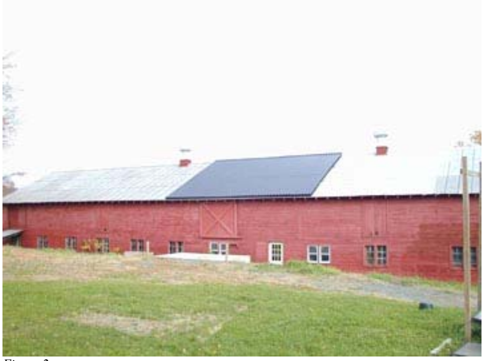
Figure 2. Solar panels on roof of barn, which increase the temperature in the loft, helping to dry wet wool and to heat the downstairs production area in winter.