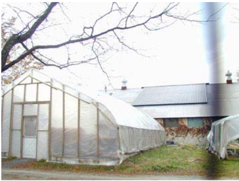
Figure 11. An exterior view of the greenhouse, with the barn and its solar roof panel in the background.