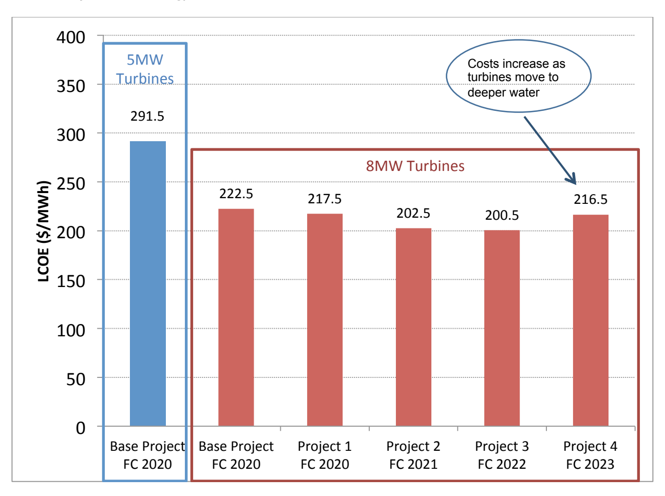
Figure S-2. Impact of Continuous Global Cost Reduction and US Learning on NYS LCOE (Stagnant OSW Policy and Financing)<sup>12</sup>