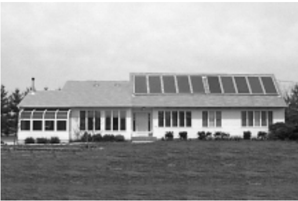
Ten flat-plate solar collectors heat water for this home in Elm, New Jersey; its many south-facing windows reduce heating bills in winter.

3. Title I Property Improvement Mortgage Insurance — Title I insurance enables lenders to make property improvement loans to creditworthy borrowers with little or no equity in their homes. For single family-homes, the maximum loan is $25,000. These second mortgages do not require energy efficiency calculations. Borrowers can piggyback Title I on Title II loans to help finance solar improvements that otherwise would not be eligible under the first mortgage.