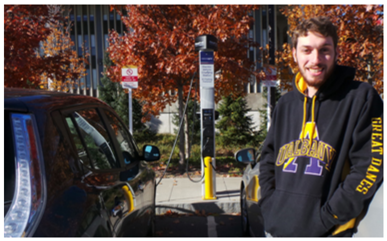
UAlbany students, faculty and staff are taking steps to reduce the University's carbon footprint.

ALBANY, N.Y. (November 7, 2013) --In recognition of Sustainability Week (Nov. 11-15), the University at Albany is launching a series of environmental initiatives aimed at reducing its carbon footprint and enhancing career opportunities for students. Most notably, beginning in the fall of 2013, undergraduates are able to enroll in a sustainability minor, a multidisciplinary program designed to provide students with a solid foundation in the environmental, geopolitical and social aspects of sustainability.