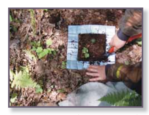
Sample collection of the O-horizon of a hardwood forest.

Preliminary results were published January-February 2006 the sue of Soil Science Society of America Journal and also presented at the NYSERDA conference "Environmental Monitoring, Evaluation, and Protection in New York: Linking Science and Policy," held October 25-26, 2005, in Albany. The full project report and more information on this project may be found at www.nyserda.org/programs/environment/EMEP/