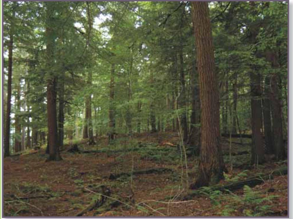
The Adirondack Mountains is the region most affected by acid rain in the U.S. New data on the current condition of its soils may tell us what the future holds for the recovery of lakes and streams throughout the region.