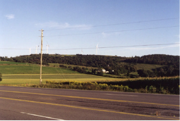
Figure 1 Wind farm simulation (upper) and photograph (lower).