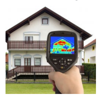
Attic Insulation Measurement