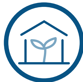
SUSTAINABLE AND CLIMATE- RESILIENT COMMUNITIES

Progress in these mission outcomes will contribute toward the State's climate objectives.