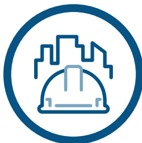
CLEAN ENERGY JOBS AND ECONOMY