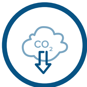
GREENHOUSE GAS EMISSIONS REDUCTION

NYSERDA WORKS TO ADVANCE THE FOLLOWING MISSION OUTCOMES IN SUPPORT OF NEW YORK STATE'S ENERGY TRANSITION: