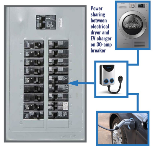
Example of load sharing