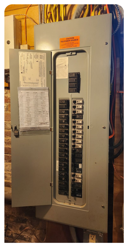
200-amp panel with 40 breaker spaces

When determining service capacity, the panel may not provide sufficient information. If this happens, refer to the chart on the following page.