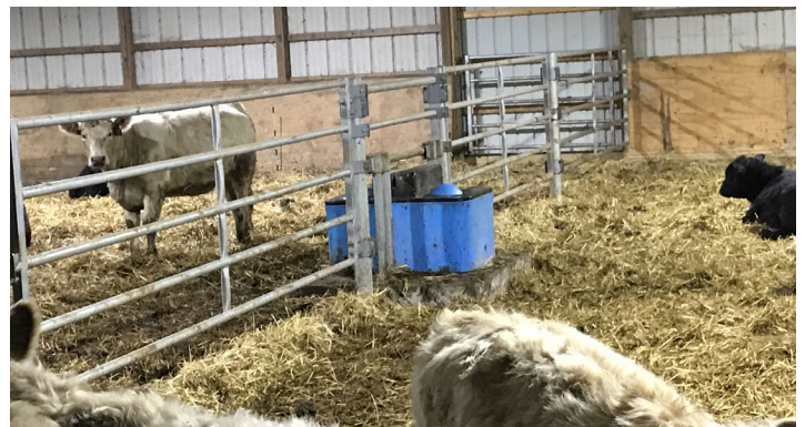
Left: A uninsulated 1,500-Watt heated tank that could be beneficial to replace with an energy-free waterer. Right: An energy-free waterer.