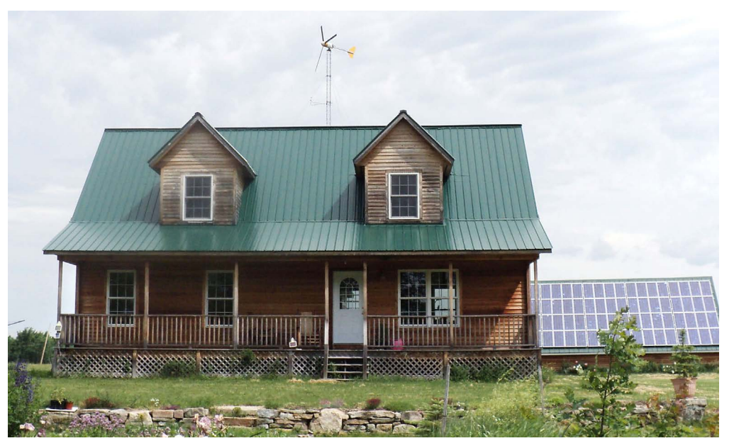
The Tyrees' built a net zero energy home in Ellenburg with a wind turbine, solar electric system, and geothermal heating and cooling.