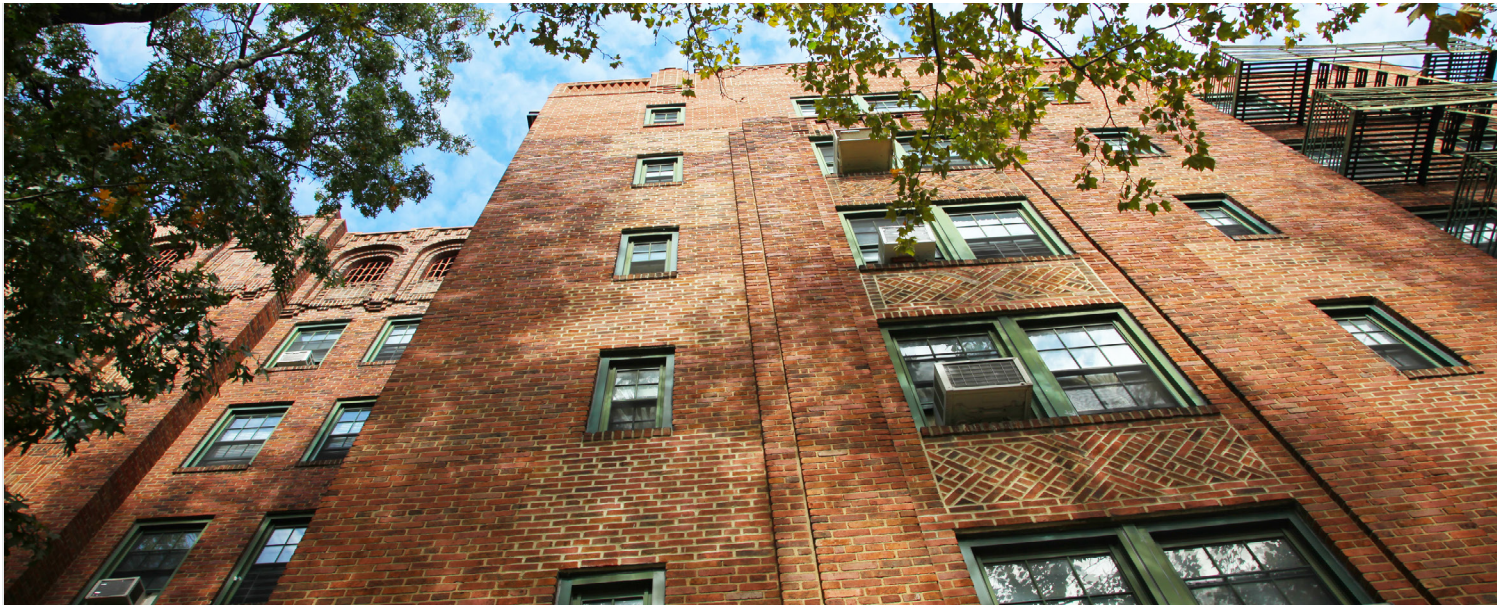
Multifamily building

Under Local Law 84, all owners of buildings larger than 50,000 square feet in New York City are required to establish benchmarks for their energy and water consumption using the U.S. Environmental Protection Agency's online benchmarking tool called Portfolio Manager. Benchmarking allows owners and property managers to correlate their buildings with comparable buildings in the city, state, and even nationwide. Once energy and water usage benchmarks have been established, owners and property managers can also determine how much energy can be saved by implementing energy-saving measures.