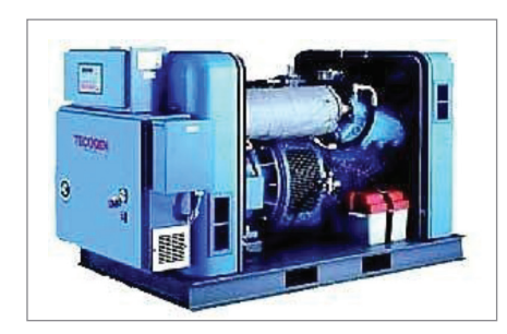
Tecogen CM-100 cogeneration unit