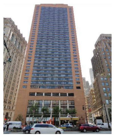
New York City Marriot - Midtown Manhattan

The NYC Marriott chose to install two arrays of 60 kW microturbines; six in one array and five in the other. Installation of microturbines in certain applications in NYC has been encouraged as a way to decrease the load on the current utilities serving the area. Doing so will also decrease emissions, reducing negative impact upon the environment.