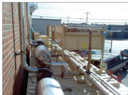
Field-assembled mechanical equipment

Since most of the HVAC equipment was in need of replacement, 4C Foods decided to install absorption chillers and convert the fan coils to use hot water at a supply temperature compatible with an engine based CHP system. A new hot water coil was similarly installed to pre-heat the air flow to the cheese dryer and further offset the demand for steam.