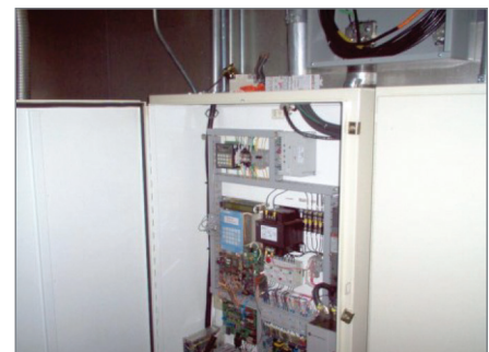
Pre-wired control panel