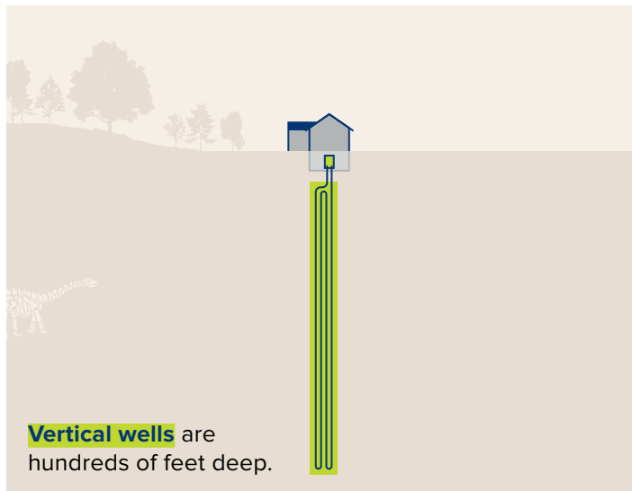
Vertical wells are hundreds of feet deep.