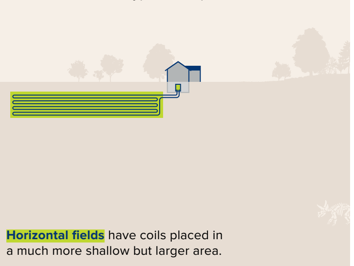
Horizontal fields have coils placed in a much more shallow but larger area.