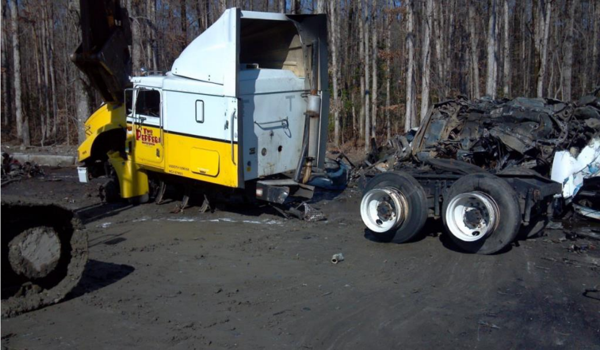
Example of chassis cut in half