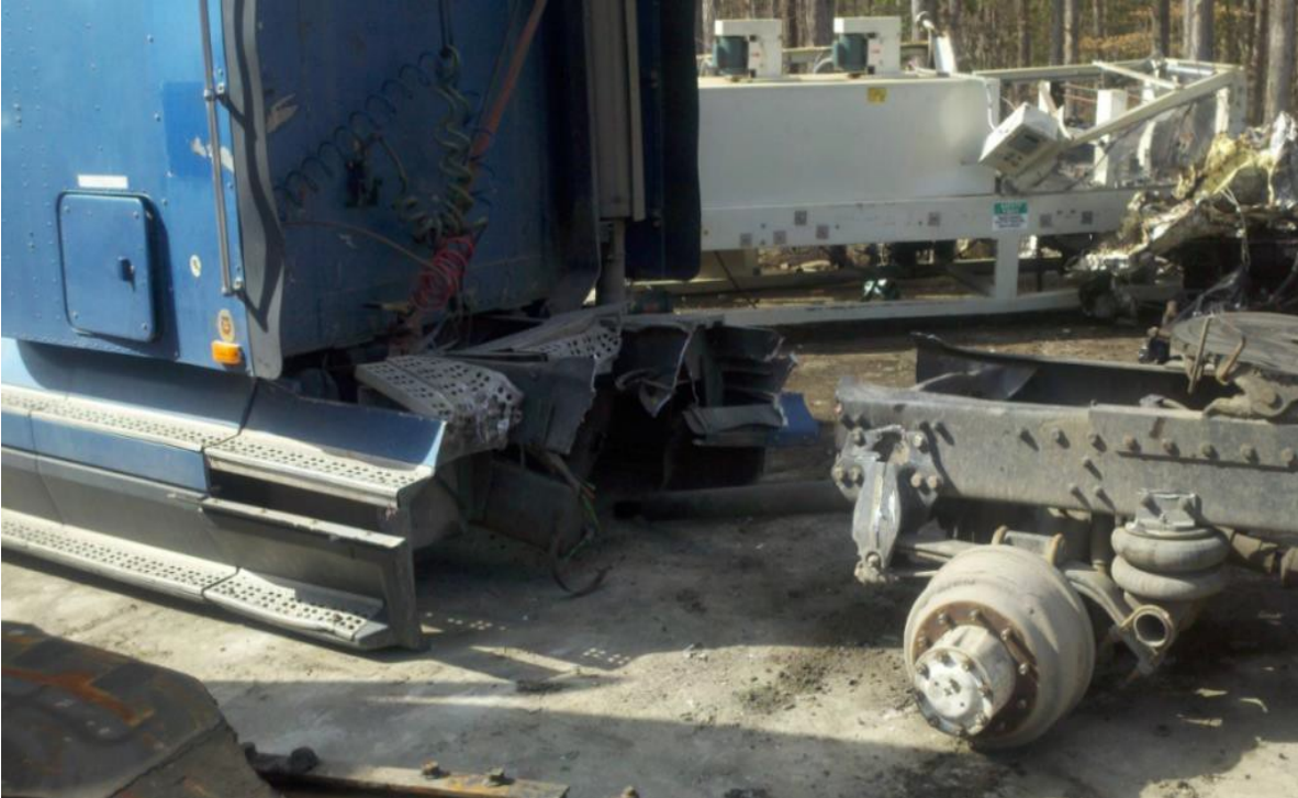
Example of chassis completely cut