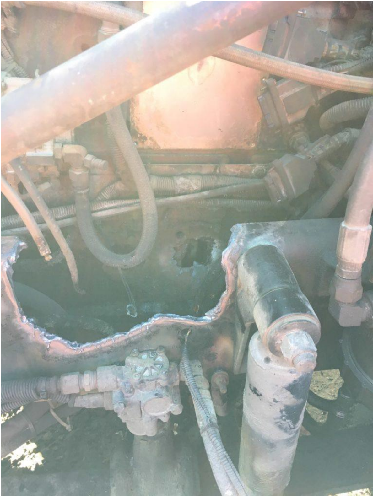
Example of complete engine hole