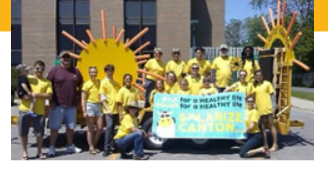
Solarize Canton at the Dairy Princess Parade

• Solar Tours – Solar owners agree to open up their homes to show visitors their solar panels and associated equipment (inverters, meters, etc.) and to talk with visitors about why and how they went solar. A solar open house is often a convincing