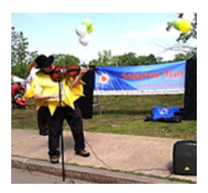
Solarize Troy Launch Event