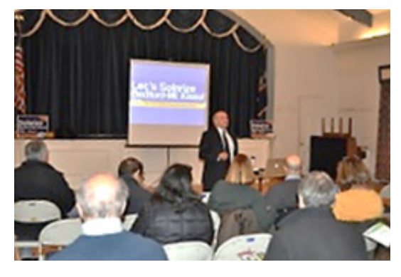
Solarize Westchester Launch Event

is usually shorter in length and more of a party atmosphere. There are a few informal remarks from Solarize organizers, local leaders, and current solar owners and it is a chance to meet the installer(s)/developer. Educational workshops are usually planned a week later to give people more in-depth information.