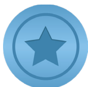
Platinum 975 points

Similar to a home built to modern energy code, a home that has both a good building shell and heating and cooling systems will usually qualify for Pearl Gold.*