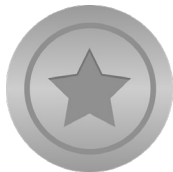
Pearl Silver 700 points

Pearl Asset Certification A home with Pearl Certified Assets has one or many energy efficient characteristics.