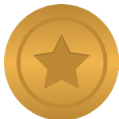
Pearl Gold 825 points

A home with good building shell (e.g., insulation), or heating and cooling features, will typically qualify for Pearl Silver.