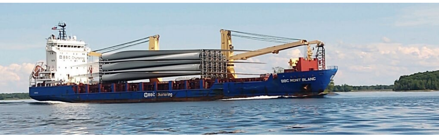
Off-shore wind turbine blades being transported.