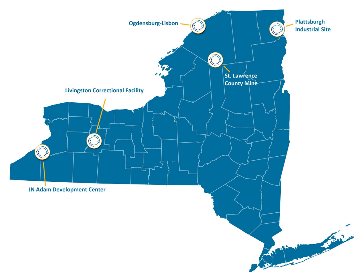
Figure 2. Build-Ready Priority Sites