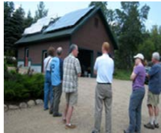
Solarize Tri-Lakes home tour

Solar Home Tours or Open Houses provide potential customers the opportunity to see solar “up close and personal.” Many solar customers have made up their mind to purchase solar after attending a solar home tour. They will have the opportunity to view the equipment, including the panels, inverters, and meters, and speak to existing solar owners about their experience.