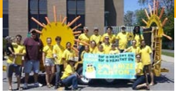
Solarize Canton at the Dairy Princess Parade