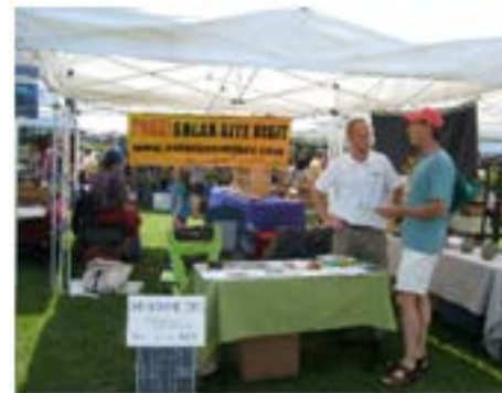
Solarize Tri-Lakes table at event.