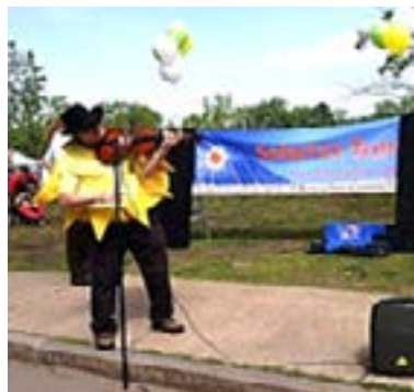
Solarize Troy Launch Event