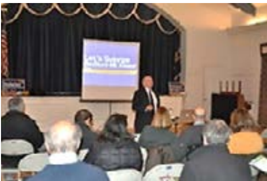
Solarize Westchester Launch Event

2) Launch Celebration/ Meet & Greet – More of a party atmosphere, a few informal comments from Solarize organizers, local leaders, and current solar owner(s); change to meet the installer(s); usually shorter in length; educational workshops usually planned within a week later so that people can also get more in-depth information.