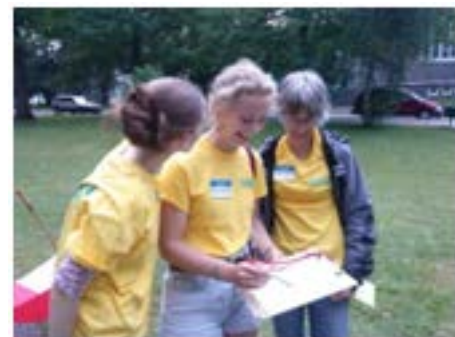
Solarize Canton volunteers at event.