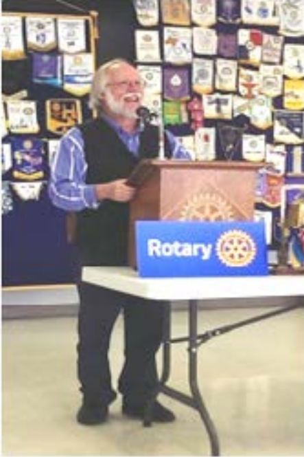
Solar Schuyler Event