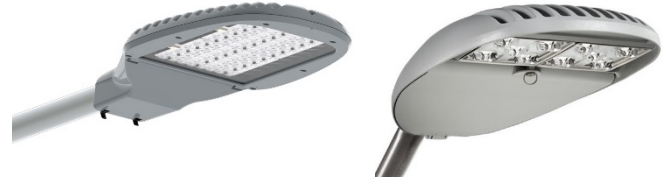
Examples of LED Street Lights