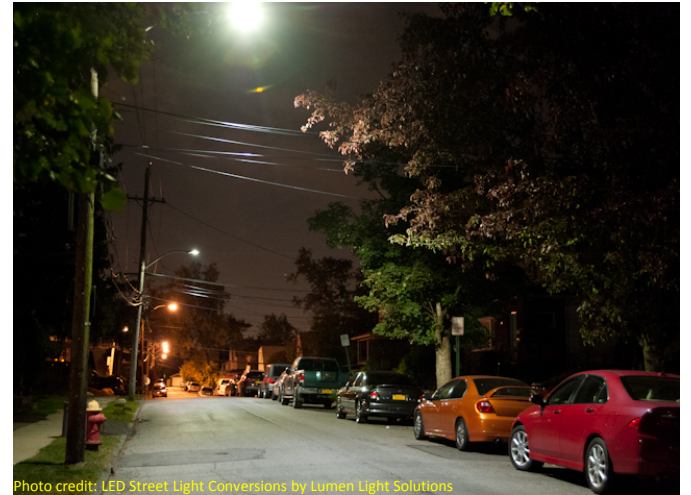
Photo credit: LED Street Light Conversions by Lumen Light Solutions