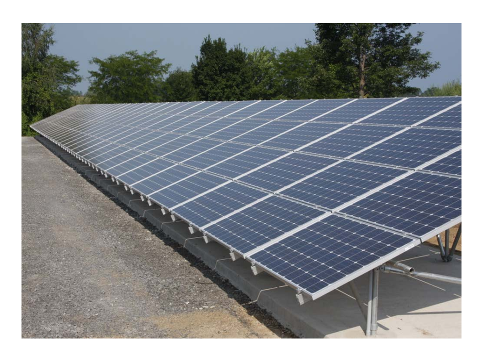
Town of Williamson, NY Solar Array