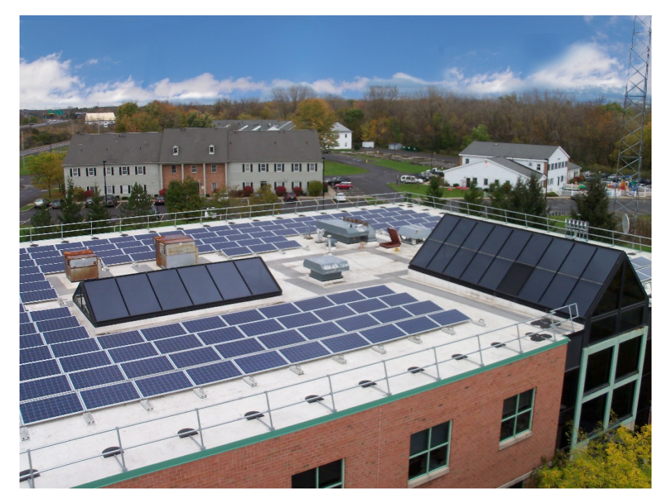
51 kW PV Array - Town of Dewitt, NY