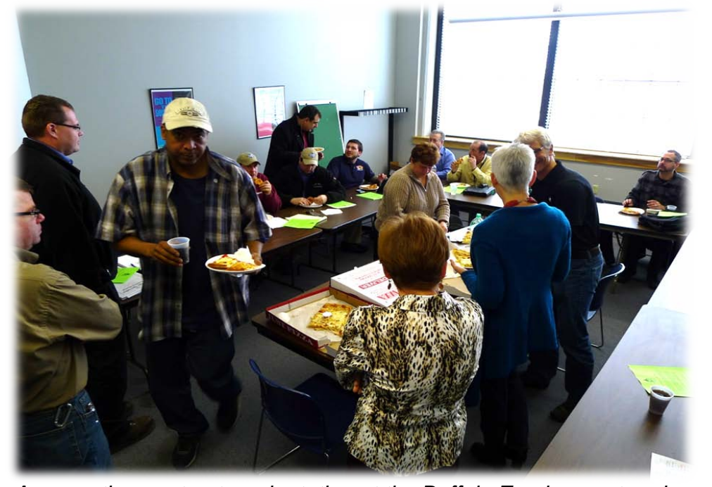
Aggregation contractor orientation at the Buffalo Employment and Training Center

Ultimately, the success of the Aggregation Pilot will depend on the commitment of each stakeholder to principles of mutual accountability, strategic collaboration, community/customer service, and social equity