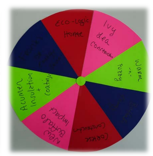
Aggregation project assignment lottery at the PUSH Green office