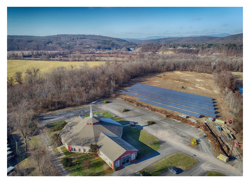
Pointe of Praise Church, whose congregation shares the power of an onsite community solar installation. Pointe of Praise case study

The Just Transition Working Group/ NYSERDA study on jobs impacts of the CLCPA is an invaluable resource, both to foster dialogue in frontline communities and to engage elected officials and business leaders. Every growth industry represented there is an opportunity for workforce development and social ventures. Some that we consider especially relevant for entrepreneurial approaches are: