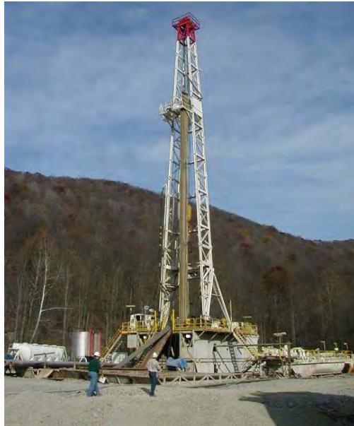
Active Well Drilling

New York State’s Environmental Conservation Law Article 23, Title 3 (ECL §23-0303(2), known as the “Oil, Gas and Solution Mining Law”, delegates all authority to regulate the gas and oil industry to the New York State Department of Environmental Conservation (NYSDEC). Municipalities do retain jurisdiction over local roads and their rights under the Real Property Tax Law. Municipalities are precluded from requiring the gas industry to be subjected to local ordinances, laws, and planning and zoning board review (i.e. requests for a variance, rezoning, and site plan review). Additionally, municipalities cannot adopt local noise ordinances directed at the drilling industry, nor restrict the hours of operation of gas drilling. 7