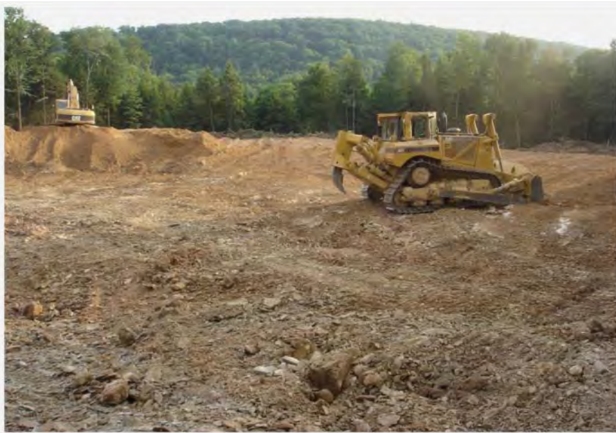
Well Pad Under Preparation (PA)

Long term visual impacts of a pad after the drilling phase are determined by whether the well is a producer or a dry hole. In either case, reclamation work must begin with closure of any pit within 45 days of cessation of drilling and stimulation. If the well is a dry hole, the entire site will be reclaimed with very little permanent visual impact unless the site was heavily forested. In this case it will take some time for trees to regrow. All that will remain at a producing gas well site is an assembly of wellhead valves and auxiliary equipment such as meters, a dehydrator, a gas-water separator, a brine tank and a small fire-suppression tank. Multi-well pads may have somewhat larger equipment to handle the increased production. The remainder of a producing well site will be reclaimed with current well pads leaving as much as 3 acres for production equipment compared to less than 1 acre as discussed in 1992.