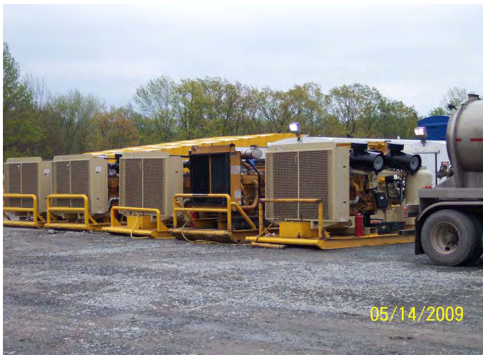
Electric Generators – Active Drilling Site: Source: NTC Consulting

While reviewing applications for natural gas wells with proposed locations close to potential receptors, NYSDEC require mitigation consistent with Program Policy DEP-00-1 entitled “Assessing and Mitigating Noise Impacts”. To aid staff in its review of a potential noise impact, the policy identifies three major categories of noise sources;