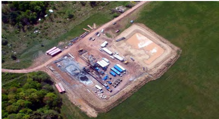
Well pad under development.

The 1992 GEIS has satisfactorily addressed the issues and impacts associated with this development. What has not been previously reviewed through the GEIS process is multi-well pads and high volume hydraulic fracturing. The adequacy of the 1992 GEIS in addressing impacts with regard to these issues will be discussed herein. Where it is found to be lacking additional mitigation measures will be recommended. Enhancements to the 1992 GEIS mitigation measures will also be provided where appropriate.