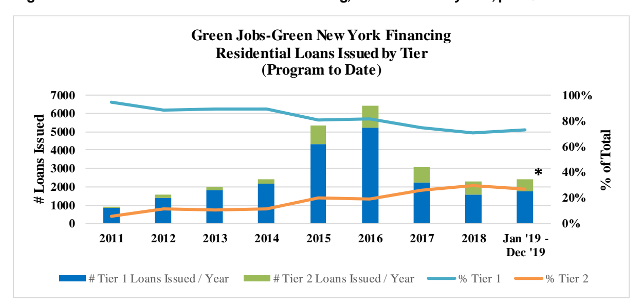
Figure 3-3. Green Jobs-Green New York Financing, Loans Issued by Tier, per Quarter.