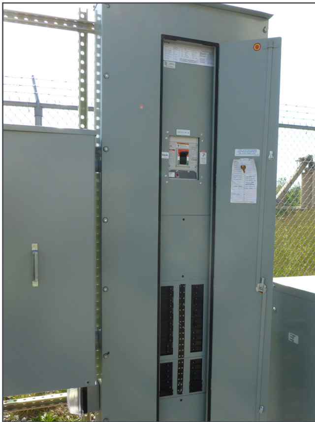
Figure 2. Electrical panel for an EV charging station at Frito-Lay in Rochester, NY.