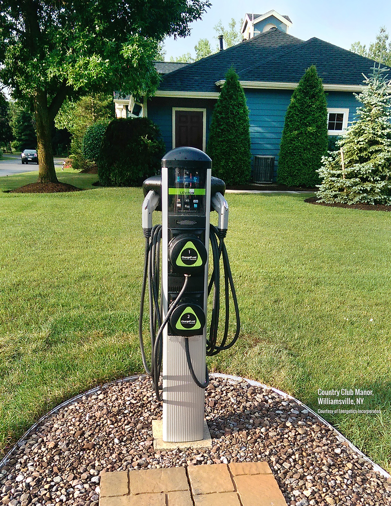
Country Club Manor, Williamsville, NY