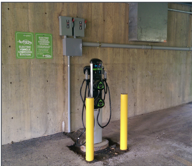
Figure 3. Electrical wire routing, single throw safety switches, and EV charging station at Pitcairn Properties' 100 Manhattanville parking garage in Harrison, NY.

have adequate power available, which results in lower installation costs. Buildings under construction or being planned are ideal for adding EV charging stations because the load calculations can be included in the overall facility design, the parking lot can be designed to optimize the station location, and conduit can be laid before any potential barriers or pavement is completed. Some sample electrical work for EV charging stations is shown in Figure 2 and Figure 3.