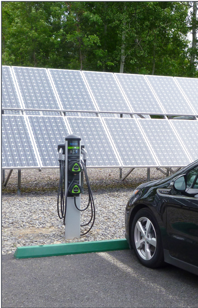
Figure 1. Bollards and tire stops used for charging station protection (left and bottom) Courtesy of Energetics Incorporated; (right) Courtesy of NYSERDA